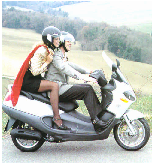
Figure 4. Piaggio's X9 has been selected as the scooter to be equipped with an electrochemical engine. The present commercial product has a 4-stroke internal combustion engine.

The fuel cell stack and the electrochemical capacitor module together with a so-called current pump to match their electrical characteristics form the electrochemical engine . The electrochemical engine is capable of autonomously reacting to power requests (within its maximum rating) if provided sufficiently with hydrogen and air. Hydrogen is stored in high-pressure tanks made of composite material. The electric rotating machine is of the AC synchronous type with permanent magnet and is connected to the rail through a bi-directional traction converter, allowing for regenerative braking. The converter includes a voltage step-up function; the higher voltage facilitates compactness of the rotating machine. Another crucial part of the system is the cooling circuit, dealing with the cooling demands of the fuel cell stack and of various electronic components like the current pump and the traction converter.