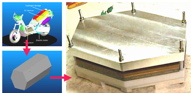
Figure 3. The special shape of the fuel cell stack allows for optimum use of the available space. The right-hand-side of the figure shows a single cell with its flow plates and end plates. The performance of the single cell was successfully verified; multi-cell tests are in progress.

The stack is operated at ambient pressure hydrogen as fuel. The hydrogen will be re-circulated yielding a relative humidity better than 70%. The incoming air is humidified through a membrane exchange humidifier with the wet exhaust gas. A dew point in the order of 55 °C can be achieved. The feed gases flow in semi co-flow configuration. For both special flow fields are realized, one at each side of a flow plate, in order to have a pressure drop that is low, but still sufficient to remove water droplets from the cell.